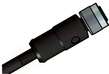
Shielded cable VK 02/L AF 1: 5 m VK 02/L AF 2: 10 m