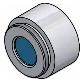
Supplementary lens PK 11/E AF 1