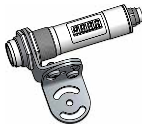
Mounting angle PS 11/U