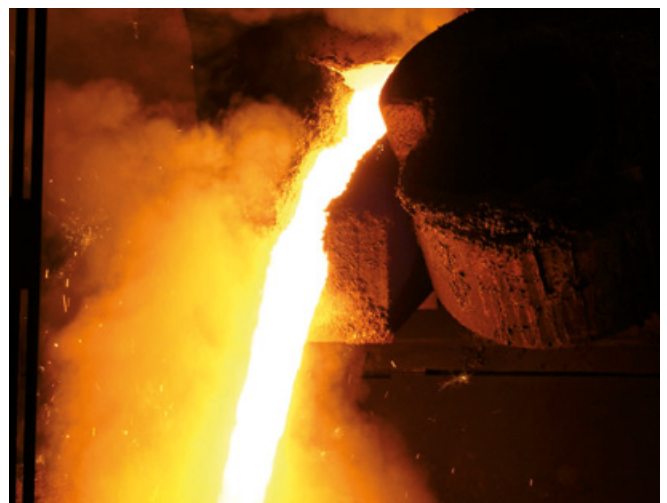
Fig. 4 Transfer of molten iron from the melting furnace into the pouring ladle

Temperature is of crucial importance as the molten metal passes from the melting furnace or forehearth to the transfer ladle or pouring ladle ( Fig. 4 ). The liquid metal must be poured