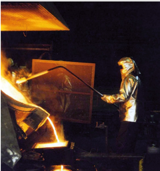
Fig. 1 Conventional temperature measurement of liquid metal using an immersion probe

Temperature is one of the most critical process parameters affecting the resulting quality, strength and working properties of a metal casting. Thanks to modern infrared thermometers, the temperature of molten metal can be accurately monitored continuously and without contact at various stages of production. The benefits: non-contact temperature detection requires far less use of immersion probes and results in reduced scrap.