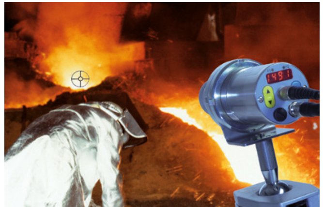
Fig. 3 Measurement at the tap hole of a blast furnace, carried out at considerable distance

At the passage where liquid metal is transferred from the blast furnace/cupola furnace to the forehearth, temperature is typically measured at irregular intervals by means of a thermo-