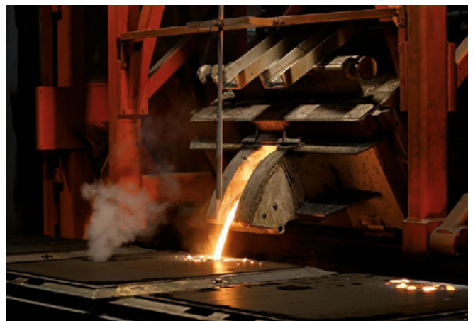
Fig. 6 Position of pour stream varies with the tilt angle of the ladle

Compounding the problem: the position of the liquid metal pour stream fluctuates. The pouring point is influenced by factors such as the tilt angle of the ladle or the stopper rod in the tapping hole of bottom pour ladles ( Fig. 6 ).