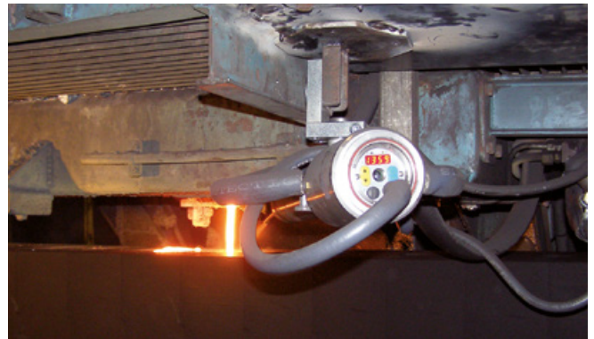
Fig. 5 Optical temperature detection at a casting machine

With optical temperature detection at metal casting operations, a pyrometer is focused on the free falling liquid metal stream just as it is poured into the mold ( Fig. 5 ). The ATD func-