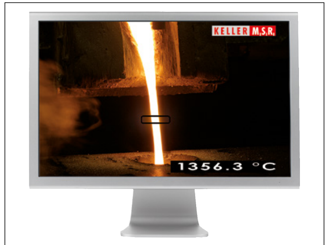
Fig. 8 Video image shows targeted measurement area and superimposed temperature reading

Because the position of the pour stream can vary with the tilt angle or due to clogging and wear of the pouring nozzle, an optical measurement technique is essential. A built-in video camera is ideal for target sighting because of the difficulty in safely accessing the installed pyrometer during running operations. State-of-the-art cameras feature TBC (Target Brightness Control). The light exposure of the image is not averaged over the total illumination, but rather based on the specifically targeted measurement area. The result is a high-contrast image of the bright pour stream in front of a dark background. The image of the molten metal pour stream at the video display terminal will always appear at optimum exposure.